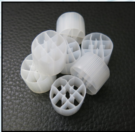
ASO ® MBBR Biological Treatment

Operational control parameters are relatively simple. All that is required is monitoring of DO (keep above 2ppm) in the reactor via continuous automated control; test the daily organic COD feed (proxy for BOD); and dip strip check the nutrient levels in system. The several installation options ensure maximum exposure of MLSS to the media. The bacteria adhere to the media while digesting waste from the plant effluent stream. The result is a resident population of biomass that removes BOD and COD efficiently.